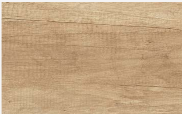
NATURAL NABRASKA OAK