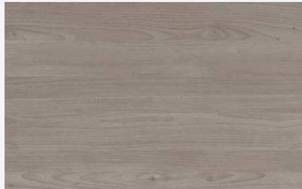
GREY NORDIC OAK